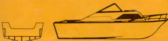
191-C O/B ATLANTIC WEEKENDER — 19'1"